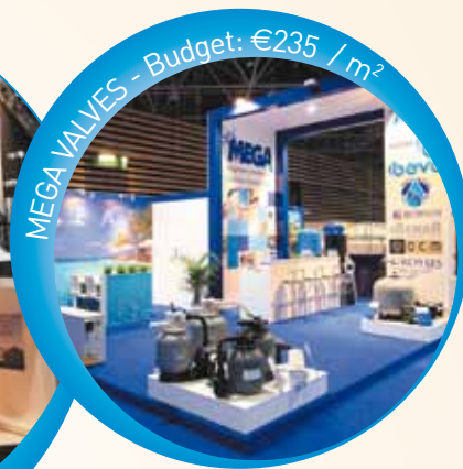
Examples of creations

See more examples of creations at www.piscine-expo.com , "Exhibit" section, then "Fit out your stand".